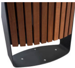
Anchor bolts fixing