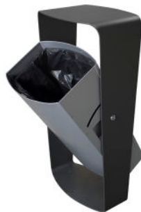
Swing body secured by a lock